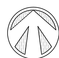
SCALE: 3/16" = 1'-0"

INDICATOR IS REPRESENTED BY THIS DRAWING AND OWNED BY, AND THE PROPERTY OF RAMOS ARCHITECTS & ASSOC. AND WERE CREATED, DEVELOPED AND DEVELOPED FOR USE ON, AND IN CONNECTION WITH THE SPECIFIED PROJECT. NO SUCH DESIGNS, DESIGNS, ARRANGEMENTS OR PERMITS SHALL BE USED BY OR ATTRIBUTED TO ANY PERSON, FIRM OR CORPORATION FOR ANY PURPOSE WHATSOEVER WITHOUT THE WRITTEN PERMISSION OF RAMOS ARCHITECTS & ASSOC. DESIGNER WITHIN DIMENSIONS OF THESE DRAWINGS SHALL HAVE PRECEDENCE OVER SCALED DIMENSIONS. CONTRACTORS SHALL BE RESPONSIBLE FOR THE SCALE AND DIMENSIONS AND CONDITIONS ON THE JOB AND THIS OFFICE MUST BE NOTIFIED OF ANY VARIATIONS FROM THE DIMENSIONS AND CONDITIONS SHOWN BY THESE DRAWINGS. SHOP DETAILS MUST BE SUBMITTED TO THIS OFFICE FOR APPROVAL BEFORE PROCEEDING WITH FABRICATION. ALL RIGHTS RESERVED © 2026.